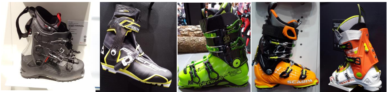
Dynafit – FT1

At the International Sports tradeshow (Ispo, Munich, 24-27 January 2016), leading winter sports brands such as Dynafit, Fischer, K2, Scarpa and Scott showcased their latest ski boot models manufactured with the Pebax® thermoplastic elastomer. This high performance material is well known to ski and mountain professional experts for its unique combination of light weight, flexibility, energy return and exceptional reliability. Depending on the models, it is used in the shell, collar or sole of ski boots.